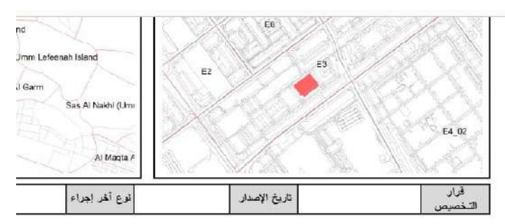
لا يوجد ملاك لهذه الأرض